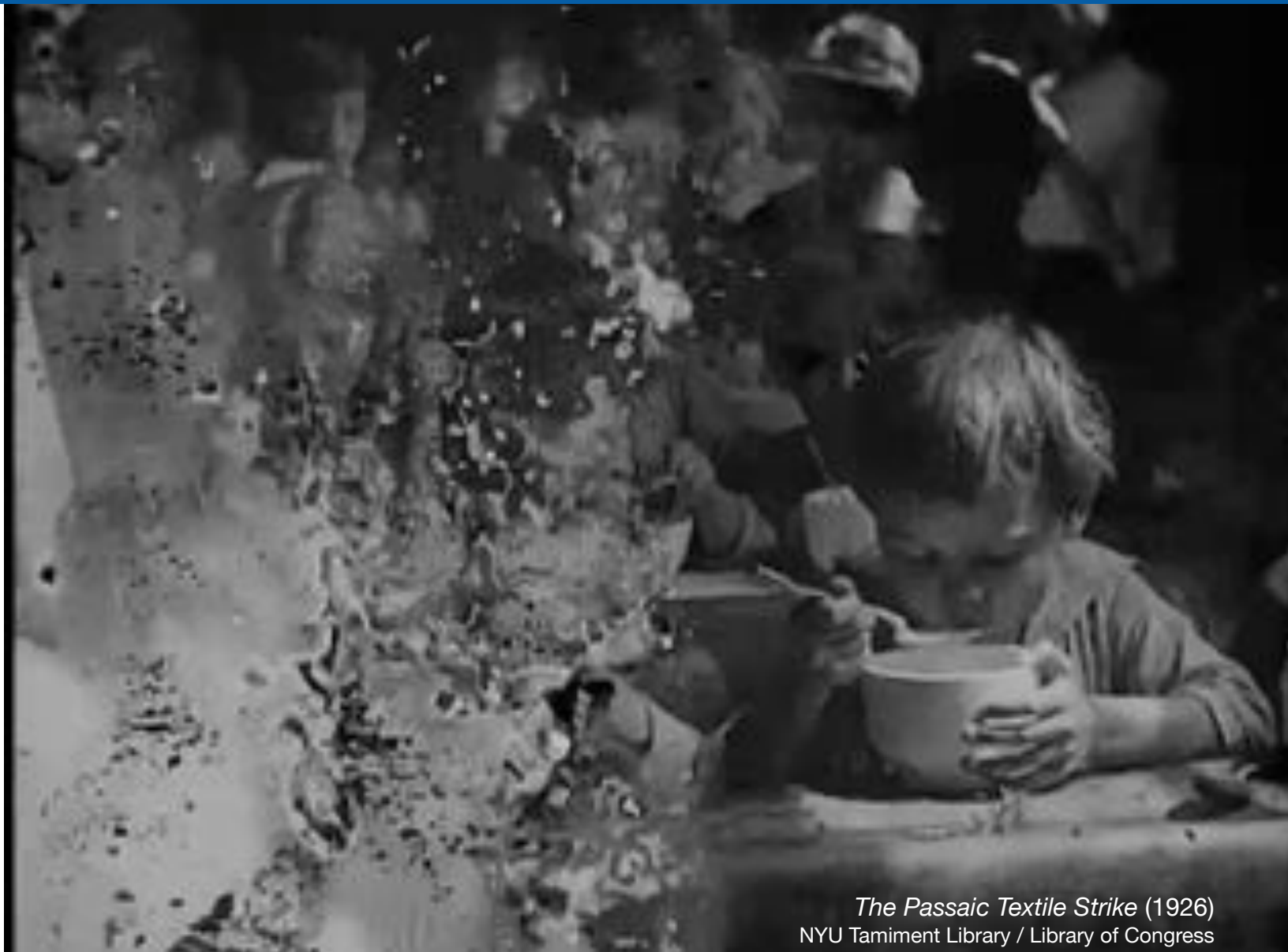
The Passaic Textile Strike (1926) NYU Tamiment Library / Library of Congress

30 archivists, academics & artists saving, studying, & screening 50 neglected films