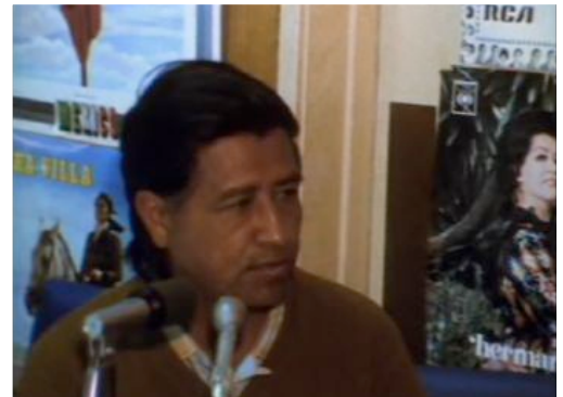
Cesar Chavez press conference, filmed by KTLA, April 30, 1973