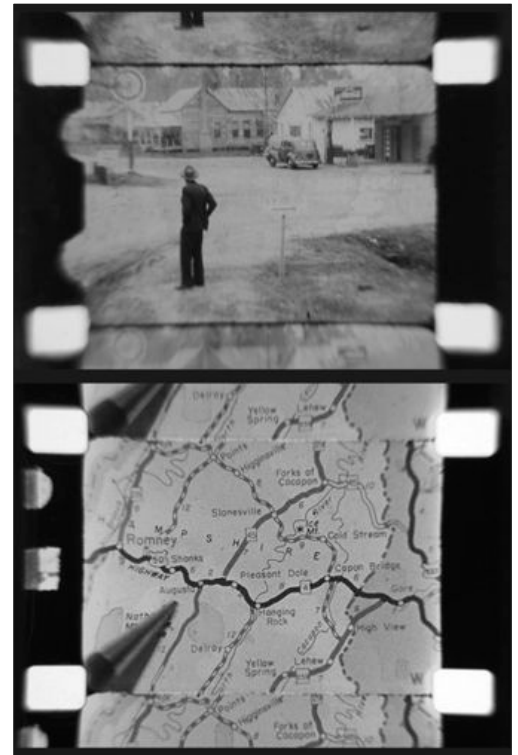
The Augustas