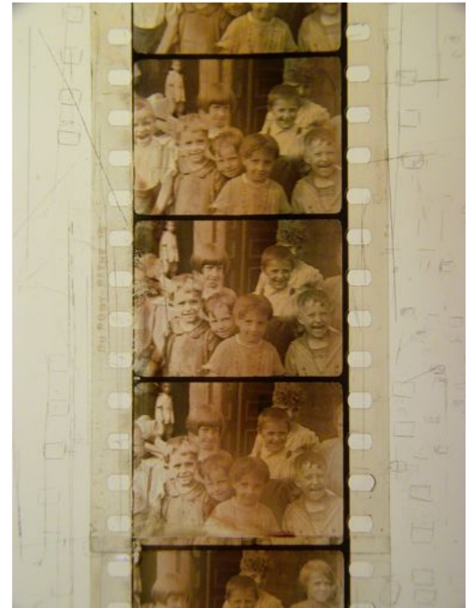
The Passaic Textile Strike , reel 5 (NYU Tamiment Library) preservation by Library of Congress

Stephen Parr (Oddball Film + Video) entrepreneurial archivist assembles signature mind-bending entertaining ironical program of film + video surprises