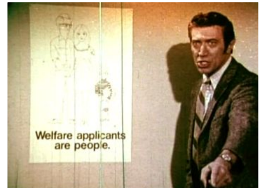
And Then They Forgot God (1971)