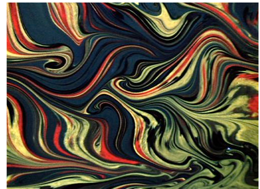
Color (Uruguay, 1955), preserved by BB Optics and the Orphan Film Project