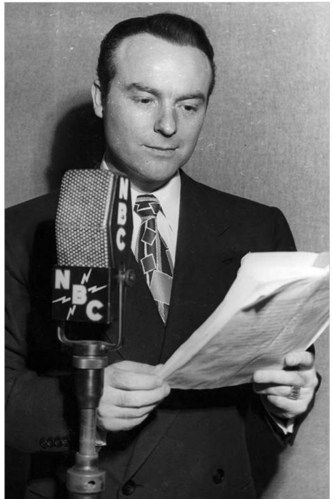
Ralph Edwards, creator, producer and host of This is Your Life .

The television series debuted on NBC in 1952 and quickly became an icon of popular culture. It aired weekly for the next nine years; syndicated shows, cable airings and