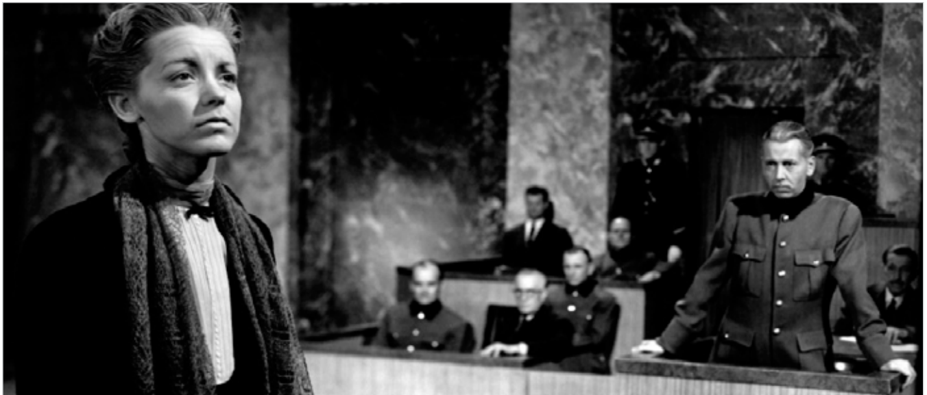
The only Hollywood wartime film to visualize the Holocaust, None Shall Escape (1944).

of references to Nazi persecution of Jews, the film's black humor turns somewhat sentimental in the final speech, given by the barber (who is mistaken for Hynkel) to the cheering masses. Both films were used by isolationist Senator Gerald Nye in Congressional hearings to prove that "the Jews of Hollywood are driving this nation to war."