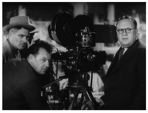
Figure 3. A visual tour of the Fox lot (20th Century-Fox, 1936) gives viewers a glimpse of the studio's process department specialists in a staged shot.

and early 1950s, the Motion Picture Association of America, in cooperation with the Academy of Motion Picture Arts and Sciences, sought to offset the economic unease within Hollywood with a public relations campaign called Movies and You, which involved a series of documentaries about the industry. The short films, which shed light on different craft positions, mixed invented and vérité scenes of the production process to tout the movie business to the public. <sup>63</sup>