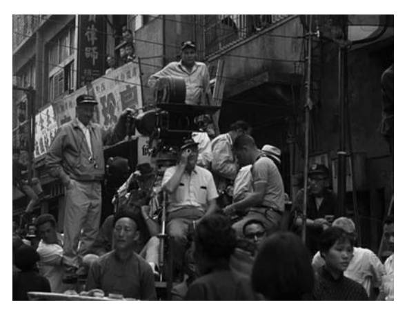
Figure 5. The promotional featurette A Ship Called San Pablo (A China Seas Film, 1966) shows how the location unit for The Sand Pebbles (20th Century-Fox, 1966) re-created Shanghai in the streets of Taipei.

difficult camera setup, the coordination of thousands of Spanish extras, and the construction of production facilities in the hills outside of Madrid. In sum, the making of a biblical epic becomes a triumph of organization. For The Guns of Navarone (J. Lee Thompson, 1961), Columbia Pictures produced a series of featurettes that followed star James Darren's Greek honeymoon in one version and the shopping spree of actors Irene Papas and Gia Scala