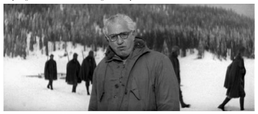
Figure 4. David O. Selznick speaks from the set of A Farewell to Arms (20th Century-Fox, 1957) on location in the Italian Alps in the promotional film The Big Show (20th Century-Fox, 1957).

With the growing need to soft-sell the production process on television in order not to violate a network's restrictions on programming that appeared as an advertisement, promotional featurettes opted for a different plan. They attempted to narrativize filmmaking by veering away from staged scenes of conventional production spaces toward documentary footage of casts and crews at work on location. By focusing on the mechanics of production, these featurettes utilized an "operational aesthetic," a concept that historian Neil Harris uses to describe the revelations of showman P. T. Barnum's hoaxes. The operational aesthetic made the desire to understand the hoax just as absorbing as the display of it. <sup>67</sup> Similarly, in featurettes the operational aesthetic