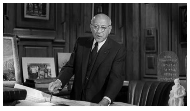
Figure 1. Cecil B. DeMille uses a map to illustrate his location unit's trek through Egypt in a long-form trailer for The Ten Commandments (Paramount, 1956).

The growth of promotional featurettes in the 1960s took place during a time of industrial uncertainty for the major Hollywood studios when the film busi-