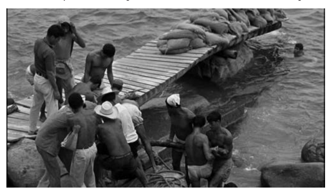
Figure 7. On the Trail of the Iguana (Professional Film Services, 1964) juxtaposes Deborah Kerr's voice-over narration with images of Mexican set builders.

is not commensurate with the actual physical labor of the set builders we witness onscreen. Consequently, the film foregrounds what is latent in the featurette, namely that the production benefited from the cheap manual labor of the locals—an important rea-